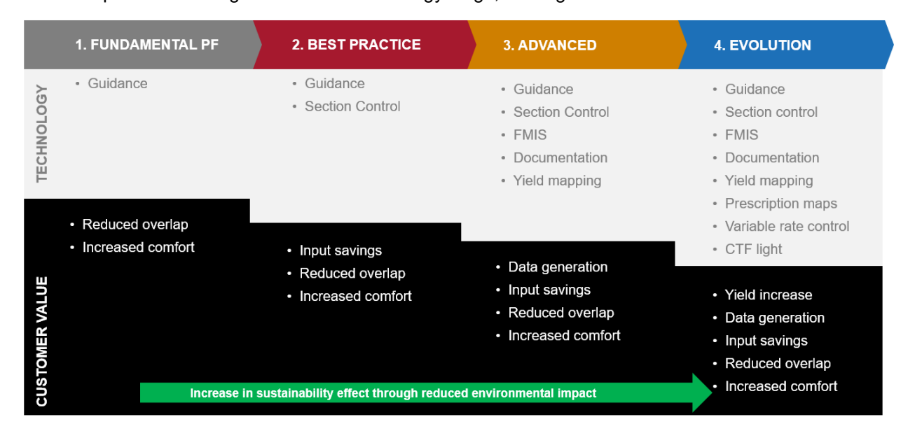
Figure 1: Valtra technology stage description.

The farm operation is categorized as 2-3 technology stage, see Figure 1.