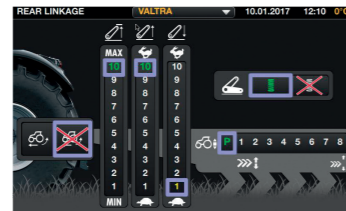
Intuitive way to set up settings with large controls and easy to understand functions.