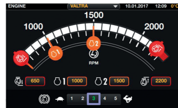
Logical to set up settings with swipe gestures. All settings are automatically stored in memory.