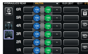
Easy configuration of worklights from the terminal. Worklight on/off switch in the armrest with beacon on/off switch.