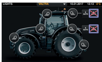
From any control you can control any hydraulic service including hydraulic valves (front and rear), linkages (front and rear) or front loader.