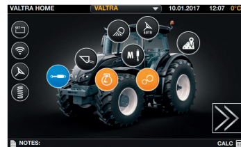
Easy to navigate menu structure.

Valtra SmartTouch has raised usability to the new level. It's more intuitive than your SmartPhone and it's available to N, T, and S Series tractors (135 - 405 HP). Settings are easily accessible within only two taps or swipes.